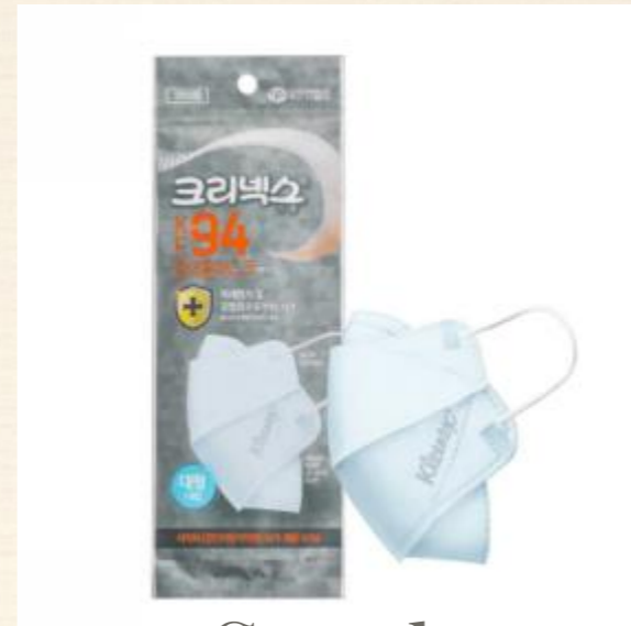
South Korean standard